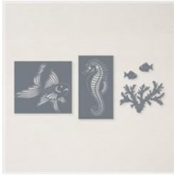
Sea Life Dies - 155684