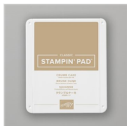
Crumb Cake Classic Stampin' Pad - 147116