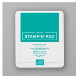
Bermuda Bay Classic Stampin' Pad - 147096