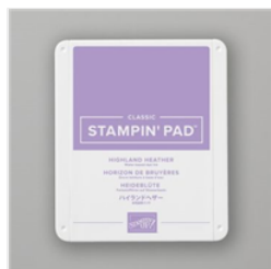
Highland Heather Classic Stampin' Pad - 147103