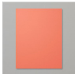
Calypso Coral 8-1/2" X 11" Cardstock - 122925