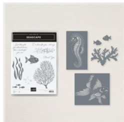
Seascape Bundle - 158359