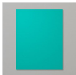
Bermuda Bay 8-1/2" X 11" Cardstock - 131197