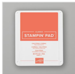
Calypso Coral Classic Stampin' Pad - 147101