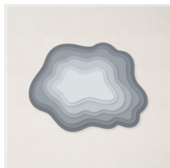
Layering Diorama Dies - 155565