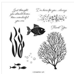
Seascape Cling Stamp Set - 155009