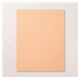
Pale Papaya 8-1/2" X 11" Cardstock - 155668