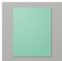
Coastal Cabana 8-1/2" X 11" Cardstock - 131297