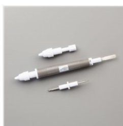
Take Your Pick - 144107