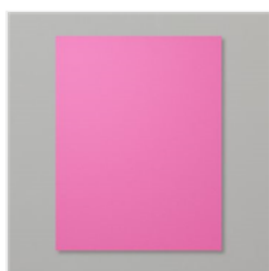
Magenta Madness 8-1/2" X 11" Cardstock - 153080