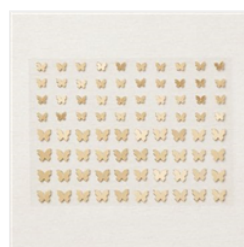
Brushed Brass Butterflies - 158136