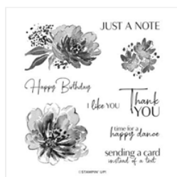
Flowing Flowers Cling Stamp Set - 157880

Dawn Griffith (248) 670-6181 Dawn@theglitterpit.com www.DawnsStampingthoughts.net