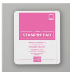
Magenta Madness Classic Stampin' Pad - 153117